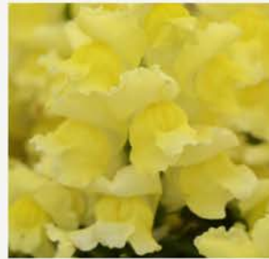
SNAPDRAGON SNAPSHOT YELLOW

Cute, blue to yellow ombred flowers on a mounding habit.