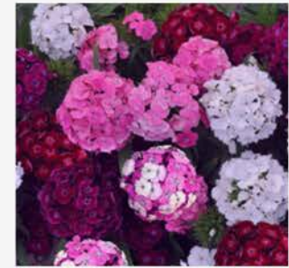
DIANTHUS DASH MIXTURE

Vibrant Pink stalks of tubular blooms on cluster habit plants.