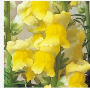
SNAPDRAGON SONNET YELLOW

Vibrant red and yellow bi-colored blooms on dense plants.