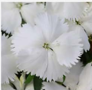
DIANTHUS CORONET WHITE

Romantic day and night. This mixture begins with a bright solid White Dianthus, blends into a romantic mixture of Burgundy/Rose, Yellow and White Pansy and tiers up to Sonnet Burgundy Snapdragons. The optional accent of Flowering Kale is a nice addition in clusters or on sides of plantings to add some extra texture.