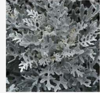
DUSTY MILLER SILVER DUST

Large orange blooms on tall spreading plants.