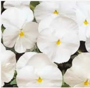
PANSY MATRIX WHITE

Pretty Pinks. This palette starts with a solid White Pansy at the front, leading into a Rose and White bi-colored Dianthus, and Bright Pink Snapdragons at the back. Dianthus Dash Mixture as an optional accent is great to add in clustered pockets, or rows at the back. The perfect palette to focus on the Color of the Year!