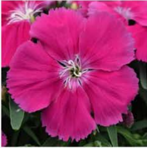
DIANTHUS CORONET ROSE

Complementary color basics with a twist! Start low with the color of the year with Dianthus Coronet Rose in this Fall planting. True Blue Pansies complement the Rose Dianthus and bright Orange Calendula, and create a nice pop of color against a Silver backdrop of Dusty Miller.