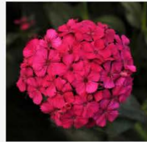
DIATNHUS AMAZON NEON CHERRY

Neon yellow, tubular flowers bloom in clusters atop cluster habit foliage.