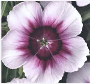
DIANTHUS CORONET WHITE W/PURPLE EYE

Effortlessly pretty. This mixture begins with a White to Purple ombre of large-flowered Dianthus, steps up to a wave of sweet Lavender Pansy and tiers up to Sonnet White Snapdragons. The optional accent of Flowering Cabbage is a nice addition in clusters or on sides of plantings.