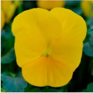
VIOLA SORBET YELLOW

Set your Autumn on FIRE! Fresh and cheery colors grab attention in this Fall planting. Yellow Violas complement Red/Yellow bi-colored short Snapdragons, and a third tier of tall Yellow Snapdragons. Dash Crimson Dianthus add a bold, Dark-Red accent.