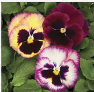
PANSY COLOSSUS ROSE MEDLEY

Large, solid white blooms cover dense foliage.