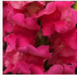
SNAPDRAGON SONNET ROSE

Rose and white bi-colored blooms on dense plants.