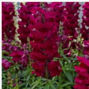
SNAPDRAGON SONNET BURGUNDY

Romantic mixture of blotches in deep rose, white with rose edges, and pale yellow with rose edges.