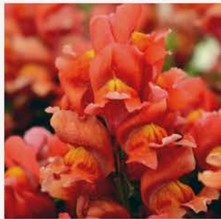
SNAPDRAGON SNAPSHOT ORANGE

Vibrant solid yellow blooms cover mounded plants.