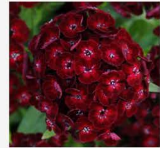
DIANTHUS DASH CRIMSON

Yellow tubular blooms grow in clusters on bushy plants.