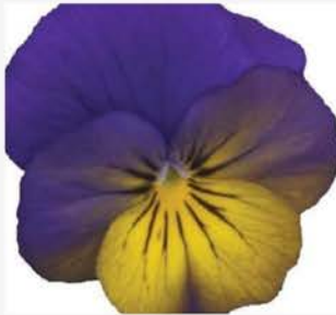
VIOLA SORBET MORPHO

Simple. Successful. Classic with a twist. Complementary tones of Blue and Yellow bookend fronds of Silver on the Silverdust Dusty Miller. Neon Cherry Amazon Dianthus create more drama with their bright, tall blooms. Color of the year spotlight: Viva Magenta