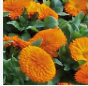
CALENDULA BON BON ORANGE

Very true blue blooms cover mounded plants.