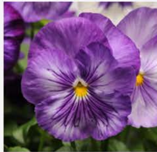
PANSY MATRIX LAVENDER SHADES

Large, white to purple ombred blooms on upright mounded plants.