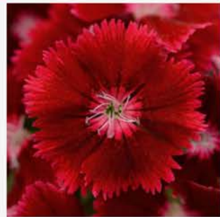
DIANTHUS FLORAL LACE CRIMSON

Short, bushy habit with deep orange flowers.