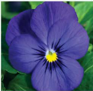
VIOLA PENNY DEEP BLUE

Primary focus! This palette is fairly short overall, perfect for plantings under signage and shrubbery. Start the front with a Deep Blue Viola, then blend into Bright Yellow Pansy and ombre to Orange Snapshots and Crimson Dianthus. Dianthus Floral Lace Crimson is a must-use in clustered plantings or a back row.