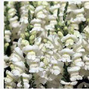
SNAPDRAGON SONNET WHITE

Light purple to lavender blooms on mounded plants.