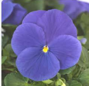
PANSY MATRIX TRUE BLUE