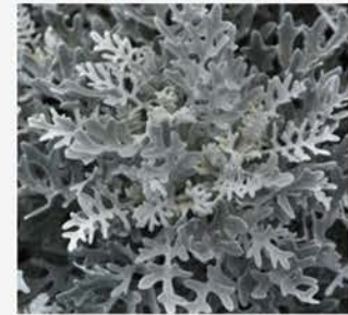
DUSTY MILLER SILVERDUST

Hot Pink clustered blooms top high above compact foliage.