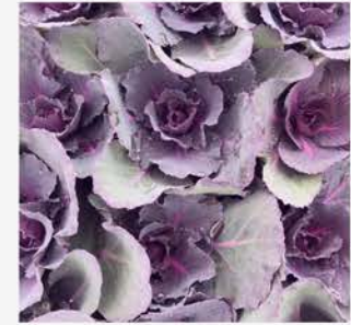
FLOWERING CABBAGE PIGEON PURPLE

Solid white stalks of tubular blooms on upright stems.