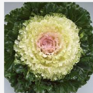
FLOWERING KALE CRYSTAL SNOW

Dark burgundy tubular blooms grow in clusters on bushy plants.