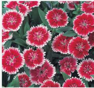
DIANTHUS TELSTAR PICOTEE

Solid white blooms cover compact mounds.