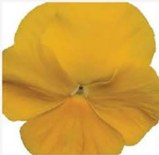
PANSY MATRIX YELLOW

Small, true blue blooms cover compact mounds.