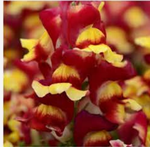
SNAPDRAGON SNAPSHOT RED BICOLOR

Small, bright yellow blooms on mounds of foliage.